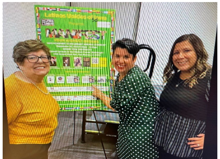
Poster filled with Presenters and Sponsors