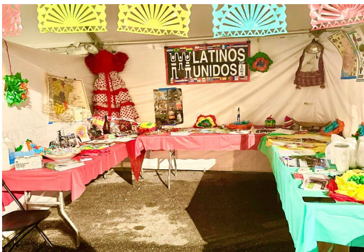
Latino Unidos of Iowa's Booth hosting 5 countries: Bolivia, Ecuador, El Salvador, España and Nicaragua.