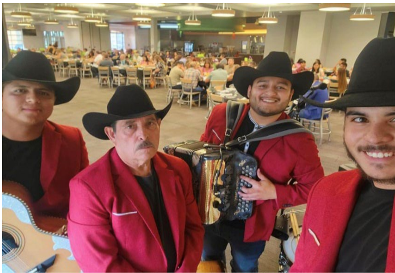
Grupo Esencia Añeja